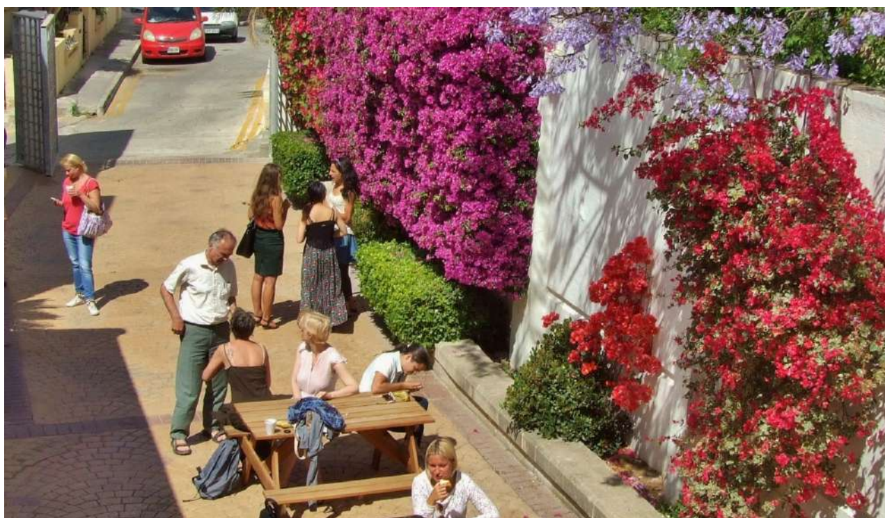
The school entrance and its front yard

Intercultural learning is a core concern of NSTS Malta because we know that intercultural competence is the key to being successful in an increasingly diverse world and is also highly relevant to your employability.