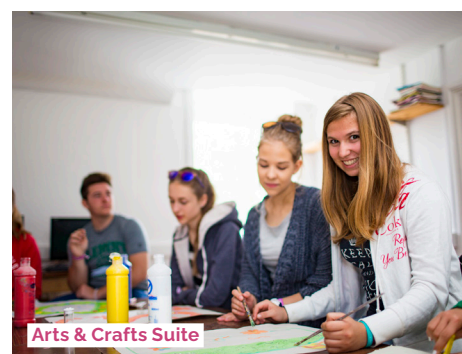
Arts & Crafts Suite