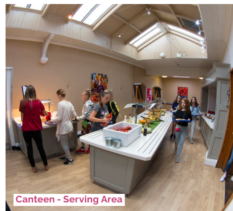
Canteen - Serving Area