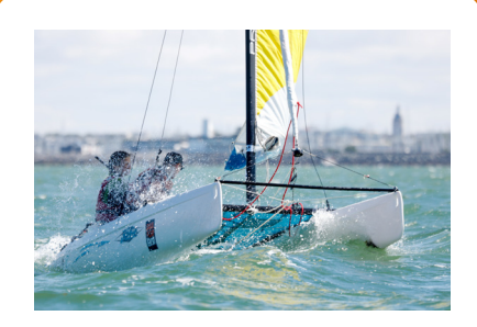
P.23 Camp - Sailing/Windsurfing