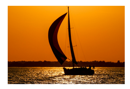
P.26 Junior Cruise