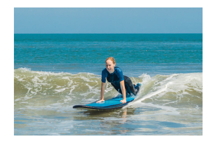
P.24 Camp - Sea, Surf & Wind