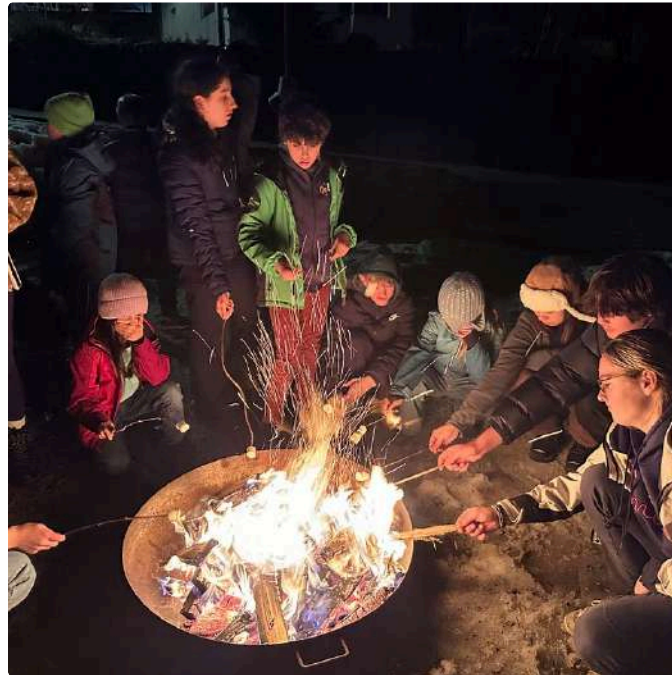
Alps Winter Camp