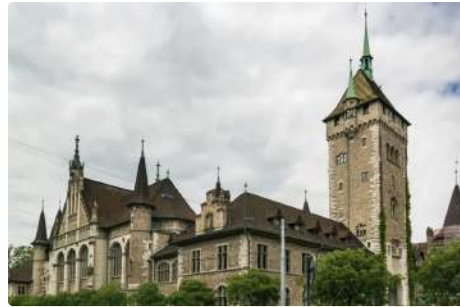
Swiss National Museum