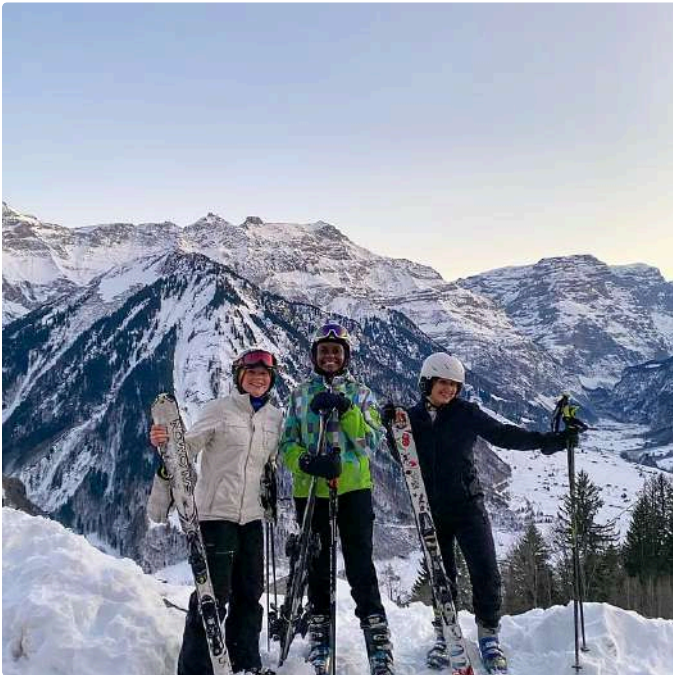
Ski & Snowboard Camp

The camp runs from 21.12.2025 to 08.03.2026 . It starts every Sunday and operates on a weekly session basis.