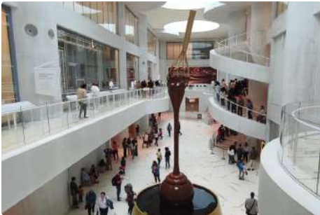
Lindt Home of Chocolate