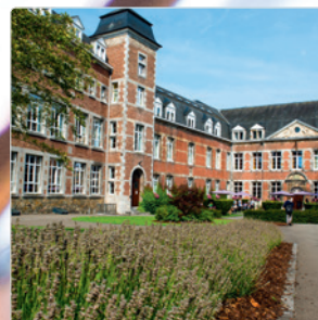
CERAN JUNIORS BELGIUM | Ferrières Residential training