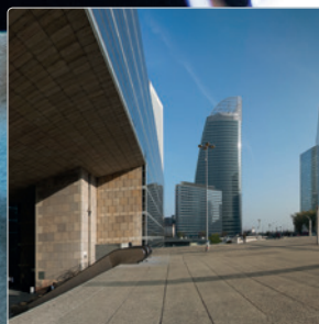
CERAN CITY | Paris Non-residential training