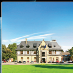
CERAN BELGIUM | Spa Residential training