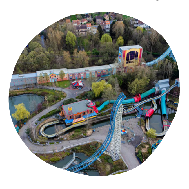
Walibi - Theme Park - Belgium

Walibi is the ideal theme park to visit with friends from all over the world. The park has attractions for all ages with a safe zone for the youngest and thrilled seekers area with sensational attractions. We will face the high speeds, put our hands in the air, feel the wind in our hair and enjoy the famous Radja River and the crazy Calamity Mine!