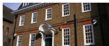
BRITANNIA SOUTH BANK