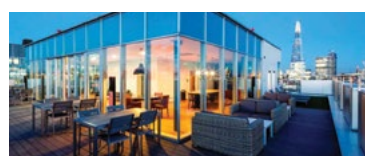
CHAPTER SOUTH BANK