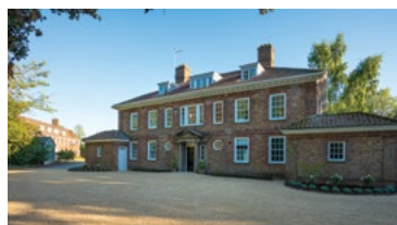
THE FRANK BELL RESIDENCE

Standard room, self-catering, shared kitchen, private bathroom