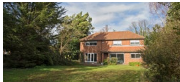
BELL GARDEN HOUSE

Self-catering, shared kitchen, shared bathroom